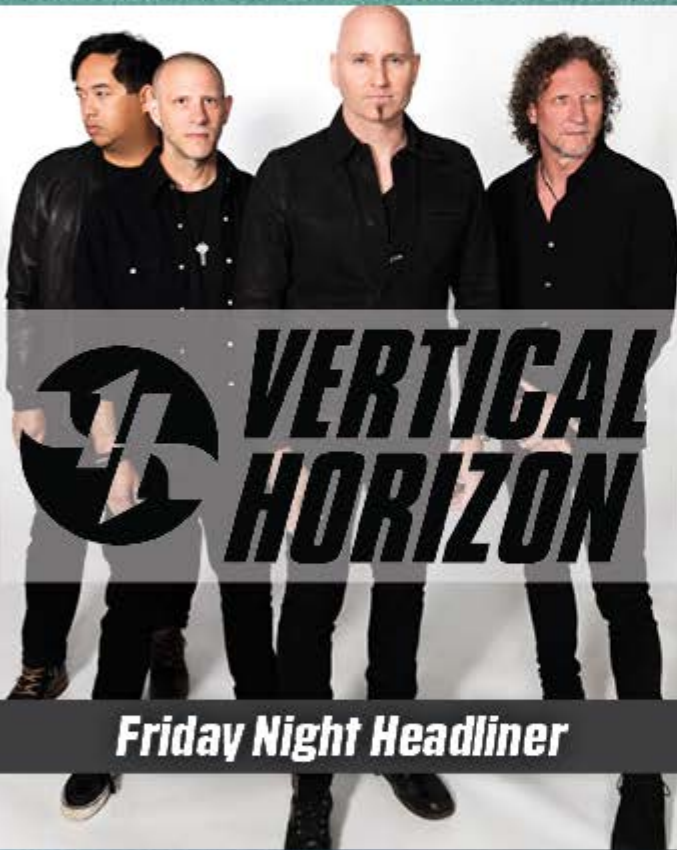
Friday Night Headliner