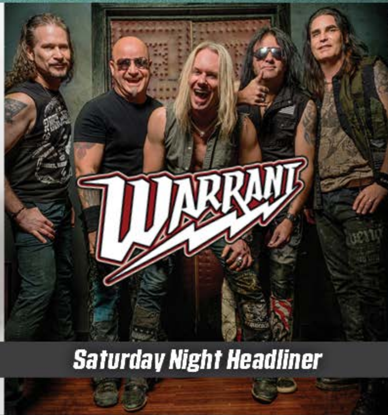
Saturday Night Headliner