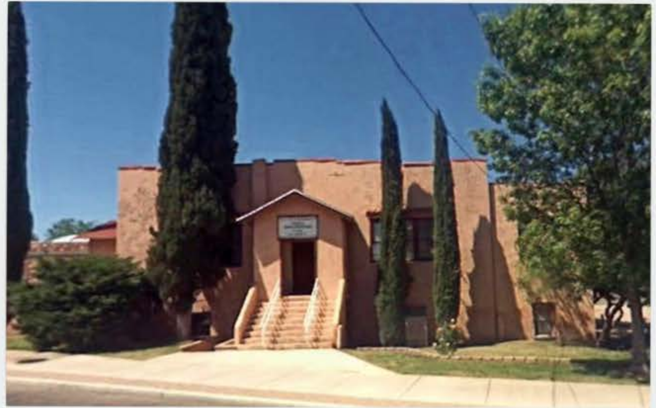
Pictured is the old rec center when it was located in Old Town Cottonwood.