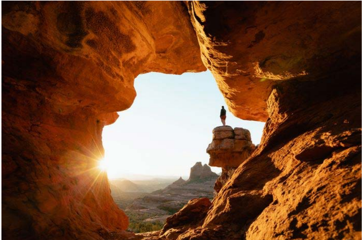
ROCKS OF AGES Natural formations such as Merry-Go-Round Rock are popular with hikers visiting Sedona.