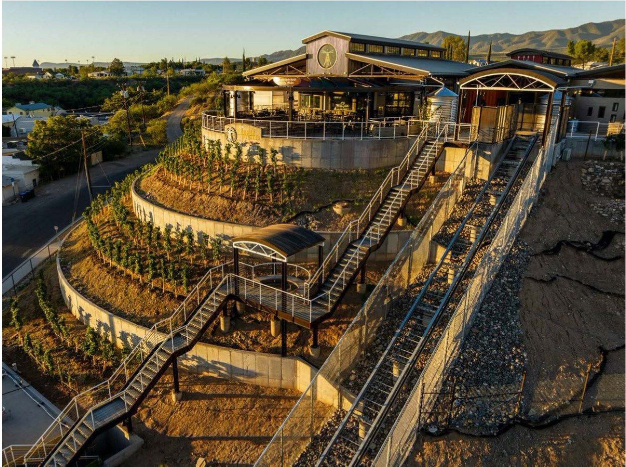
Clockwise from top: Swinging for the hills at Sedona Golf Resort; Merkin Vineyards Hilltop Winery and Trattoria is one of a number of new vineyards transforming the area around Sedona into a wine destination; elk chops from Cowboy Club Grille and Spirits.

Meanwhile, Sedona Golf Resort —and the recently facelifted Hilton next door—attracts those who prefer golf sticks to incense ones. Be warned: It can be tough keeping your eye on the ball given the views of encircling rock formations. Just around the bend, Tlaquepaque Arts & Shopping Village packs in more than 50 galleries and boutiques, including a nicely curated vinyl shop called Alt Books and Records. Afterward, tuck into upscale Mexican fare at nearby Elote Cafe , where smoked pork cheeks are served in a rich cascabel chile sauce, tastiest when paired with a guava-and-serrano margarita.